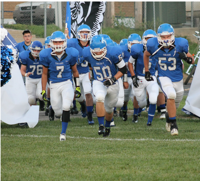
Above: The Trojan football team runs through the pre-game banner.