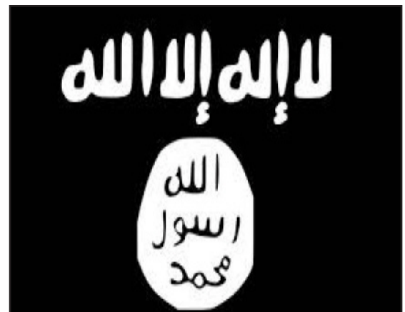
The flag of ISIS that says that all must join The Muslim god Muhammad or die.