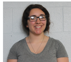
Bailey 5 Guys